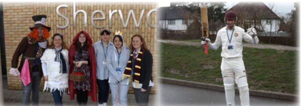
SCWA Staff joining in the fun for World Book Day!