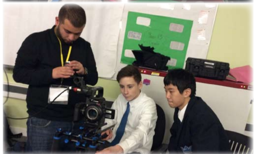
SCWA students participating in the That's Bellion Film Production Ltd visit